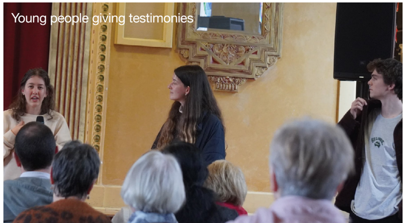
Young people giving testimonies