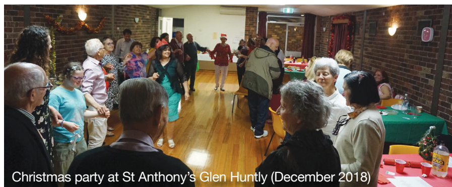
Christmas party at St Anthony's Glen Huntly (December 2018)

When the Revival comes, the Community will rise to the occasion by implementing new versions of the evangelisation and formation programmes.