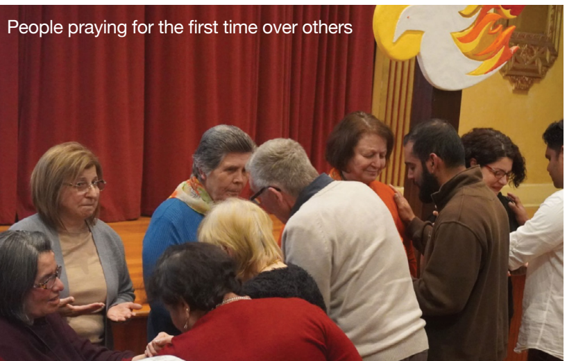
People praying for the first time over others

The supercharged event was powerful and prophetic, and I came away with many learnings and inspirations.